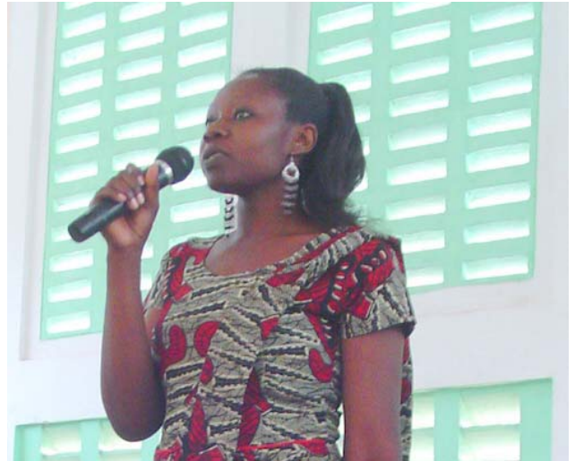
"Village life in Israel ceased, ceased until I, Deborah, arose, arose a mother in Israel." – Judges 5:7

Answering God's call to Leadership involves sacrifice. By submitting herself to His will she is readying herself to act on the vision God has placed in her heart, the vision that a strategic step